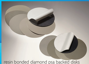
resin bonded diamond psa backed disks

All of our products are made in our Windsor, Vermont factory USA